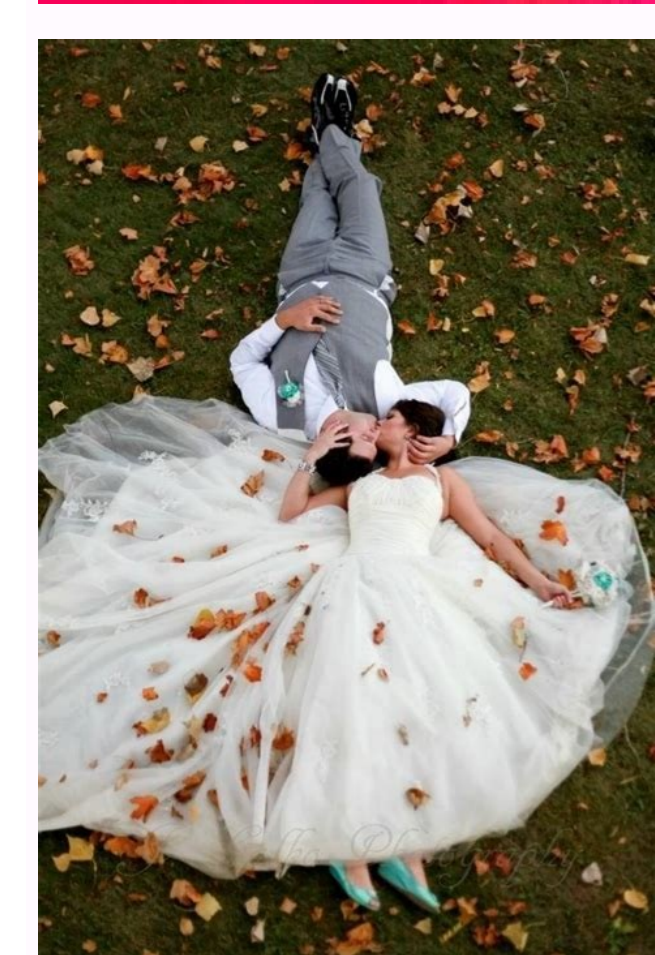
Pinterest wedding invitation ideas. Best wedding font for invitation. Indian wedding invitation templates pinterest. Best templates for wedding invitation.