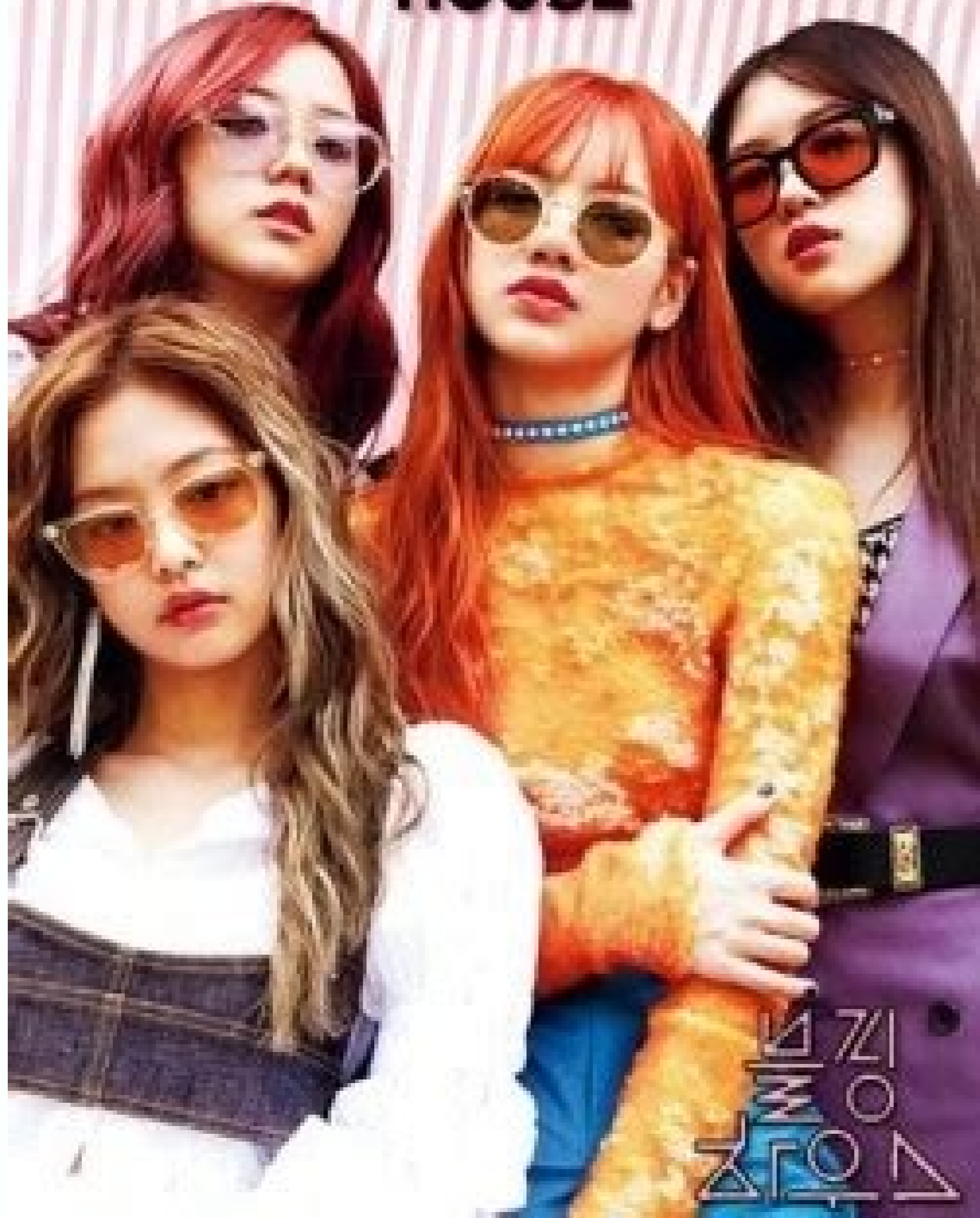
Blackpink house ep 8 eng sub full.